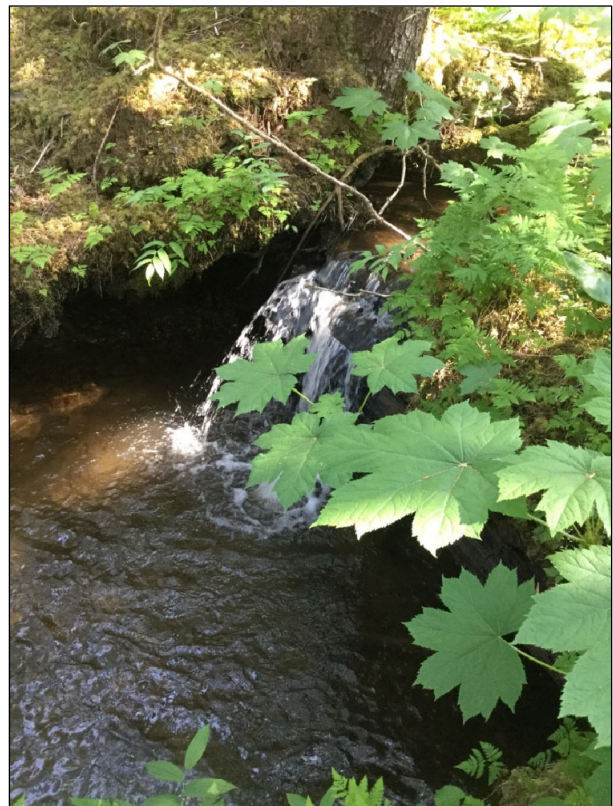
Figure 3.—Log jam falls at waypoint 873.