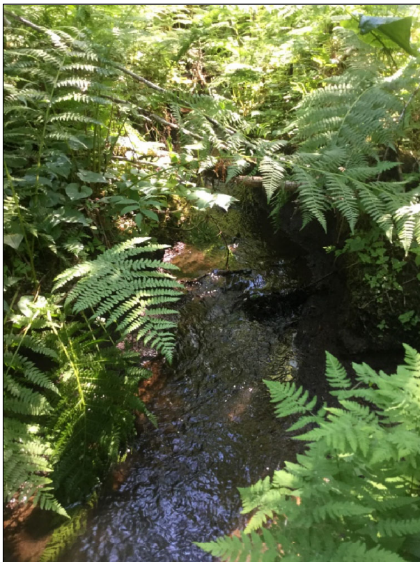
Figure 2.—Channel at waypoint 875.