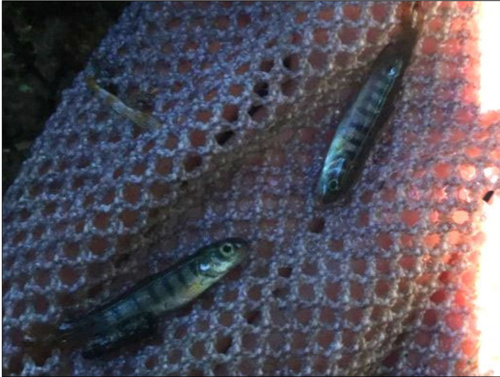
Figure 1.—Juvenile coho salmon captured at waypoint 876.